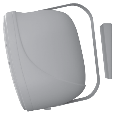
vertical use of the speaker